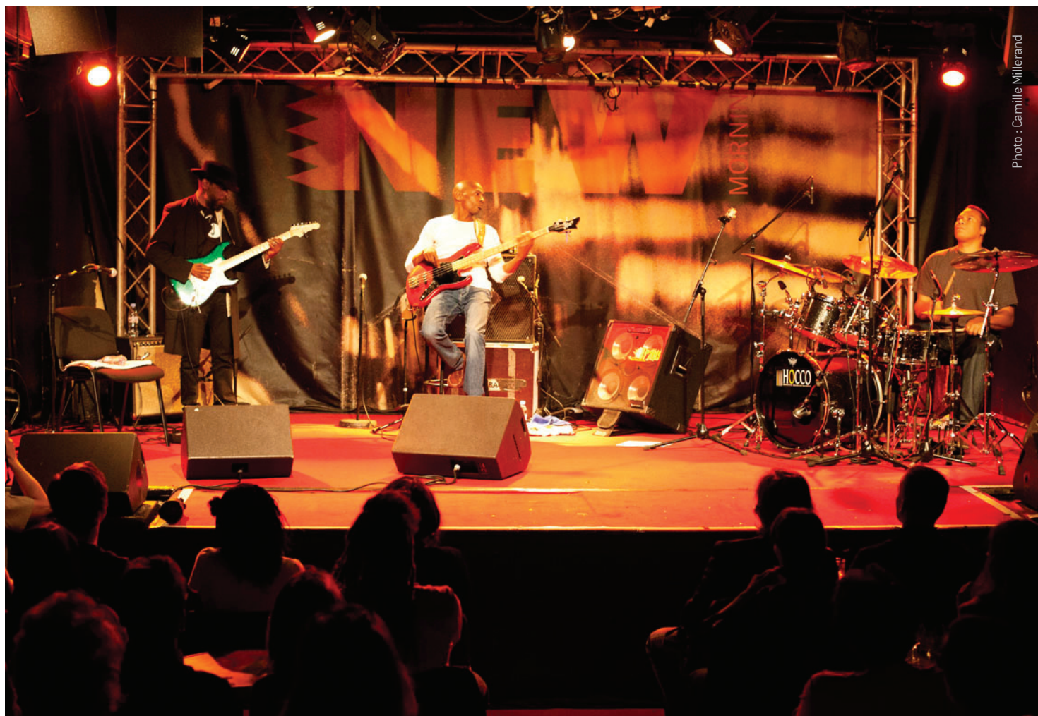
Live at New Morning (Paris)