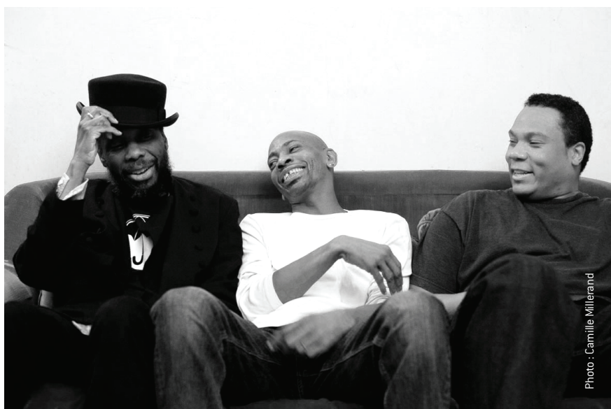
Backstage with the "DREAM TEAM"